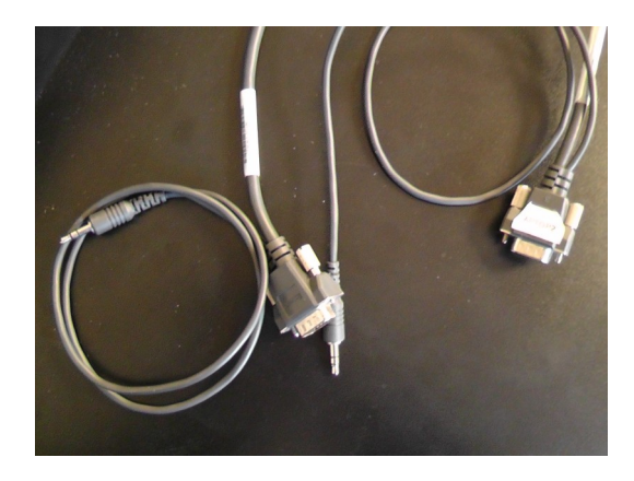
LAPTOP 1 & LAPTOP 2 INPUT SELECTIONS/CORDS